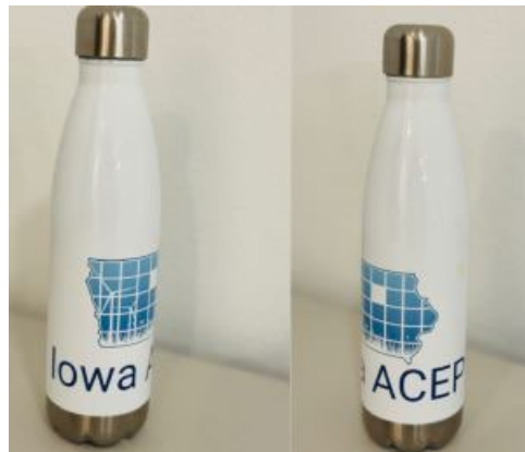
Check out the swag you can order!

Thanks for representing the Iowa ACEP Chapter!